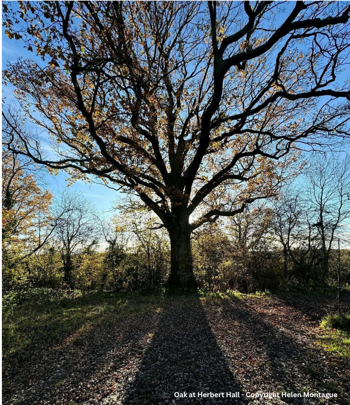
Oak at Herbert Hall